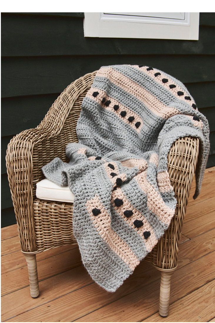
Designer: Two of Wands Lion Brand® Hue + Me Pattern Number: M2O281.TWH